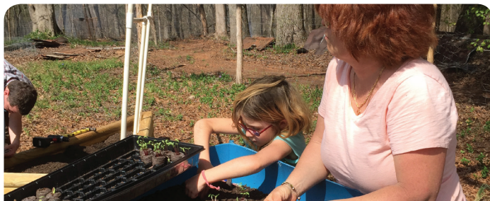
PRE-SYMPOSIUM: Tour of Columbia School Gardens Wednesday July 13, 8:00am–12:30pm

This pre-symposium trip will visit school gardens throughout Columbia that are involved with South Carolina Green Steps, a statewide program that “recognizes schools who take annual sustainable steps toward becoming more environmentally responsible.” Teachers at Catawba Trail Elementary School, St. John Neumann Catholic School, and the Barclay School at Magnolia Farm will share insights into their school gardens and how they fit into daily school life. As a public elementary school, a private preK-6th grade school, and a non-profit school offering an alternative approach for students who learn differently, these schools will demonstrate a variety of successful settings and approaches for a thriving school garden program.