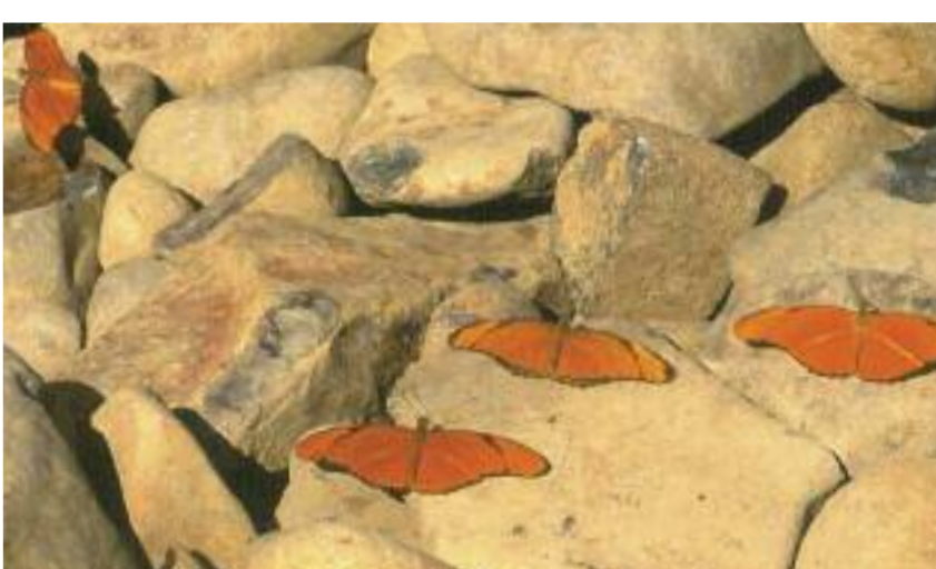
Flattish rocks in a sunny part of the garden offer butterflies a site to bask on cool days.

You are off to a good start by growing the nectar plants and host plants butter-flies seek, because this will also encourage other beneficials—including predatory insects such as lady beetles and lacewings—to take up residence in your garden, which will help keep pest populations in check.