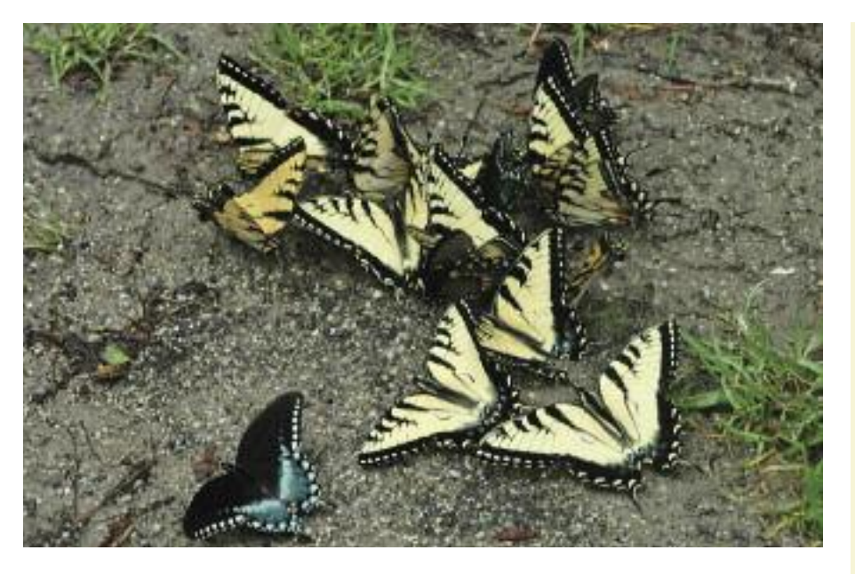
Another way to enhance your garden's appeal to butterflies is to provide a moist "puddling" site like this one, where they can gather to drink up needed nutrients.

Puddles are another way to offer valuable nutrients. Mostly adult males gather around these wet spots—a behavior known as "puddling." The nutrients strengthen the male's sperm, encourage breeding, and improve the viability of the female's eggs. Much like the highly concentrated nutrients in dried fruit (as opposed to fresh), they become even more